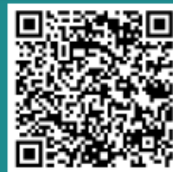
Looking After Yourself