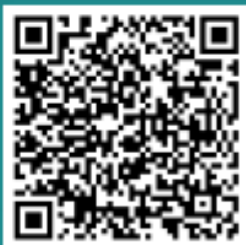
Keeping Your Home Warm