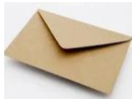
GCSE Awards Evening